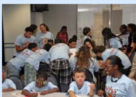
BBYC members busy at work.

The BBYC is an arm of the Anti-Bullying Advisory Committee. The Youth Council consists of approximately 80 kids from ages 7-17 from all over Hillsborough County. The BBYC has elected its own Council President, Vice President and Secretary. The group meets once a month and works on various projects to raise awareness about bullying and develop ways to stop the bullying cycle. Some of the activities include a bowling night, a youth rally, and the Too Good For Drugs and Violence Walk & Kidfest on October 2 at MOSI.