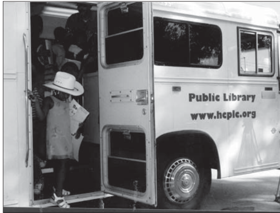
A YOUNG READER LEAVES THE BOOKMOBILE DURING A RECENT VISIT TO THE PROGRESS VILLAGE RECREATION CENTER.

If you live in any of these neighborhoods, or know someone who does, let them know that they can connect to a world of information and books at their Parks & Recreation Center. For more information, call 273-3652, ext. 2, or visit www.hcplc.org .