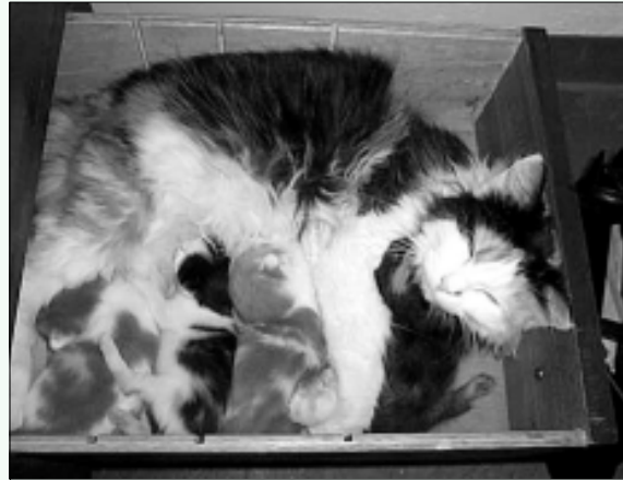
This mother cat, resting safely in a drawer with her litter at Animal Services, isn't aware there are more cats and kittens waiting to be adopted than there are homes for them.

For a glimpse at the cats waiting for you and to get complete adoption information, go to: www.hillsboroughcounty.org/animsvcs and click on the Online Kennel. For more information, call 744-5660.