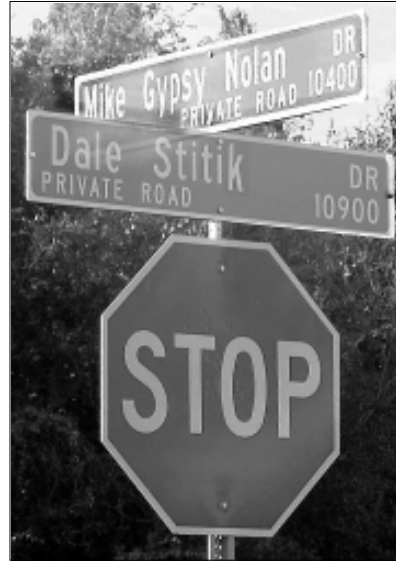
These street signs are located on the property with the Northwest Regional Water Reclamation and Northwest Regional Residuals Recovery plants.