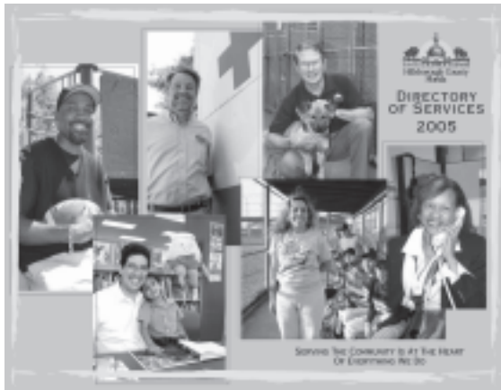
Hillsborough County's new Directory of Services will be available to residents in January 2005.

For your convenience, information about the Constitutional Officers, the Officers of the 13th Judicial Circuit, and the various boards, councils and authorities that make policy and/or levy taxes in Hillsborough County can also be found. Copies of the directory can also be downloaded from Hillsborough County's web site at www.hillsboroughcounty.org .