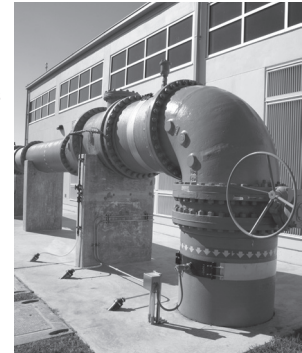
The Central Hillsborough Water Treatment Facility began operating in February 2009.

The water plant is not the only Public Utilities operation that receives its electricity from the waste-to-energy facility. The Brandon Support Operations Complex, the Falkenburg