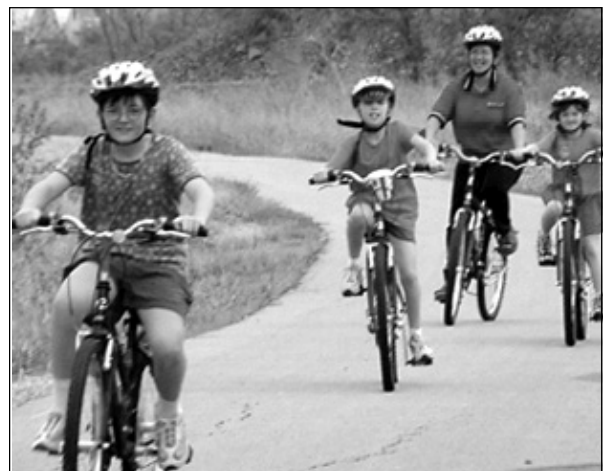
Wearing helmets is an important part of bicycling.