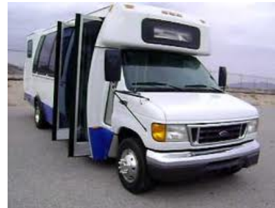
Hydrogen powered vans