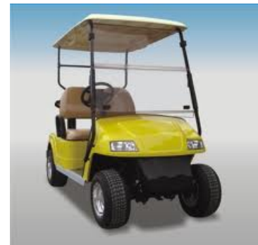
Electric Golf Carts