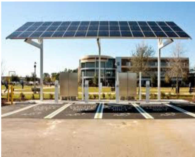
EV charging stations coming soon!