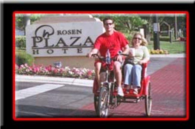
Pedicabs / bike taxis