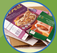
Dry Paperboard Boxes