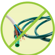
NO Garden Hoses, Cords, Ropes, or Wires