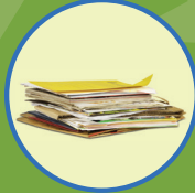
Dry Paper, Newspaper, and Junk Mail