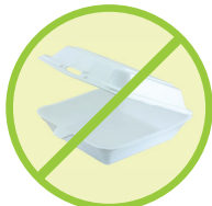
NO Polystyrene Foam or Styrofoam™