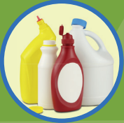
Clean Plastic Bottles and Containers (caps on)