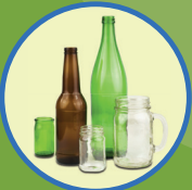
Clean Glass Bottles and Jars