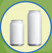
Clean Aluminum Cans