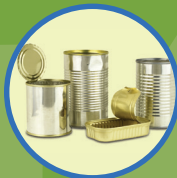
Clean Steel and Tin Metal Containers