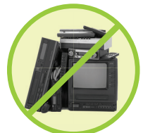
NO Electronics (recycle at a Community Collection Center)