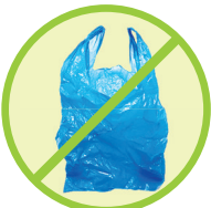
NO Plastic Bags or Film