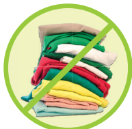
NO Clothing, Shoes, or Textiles