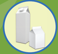
Clean Milk and Juice Cartons