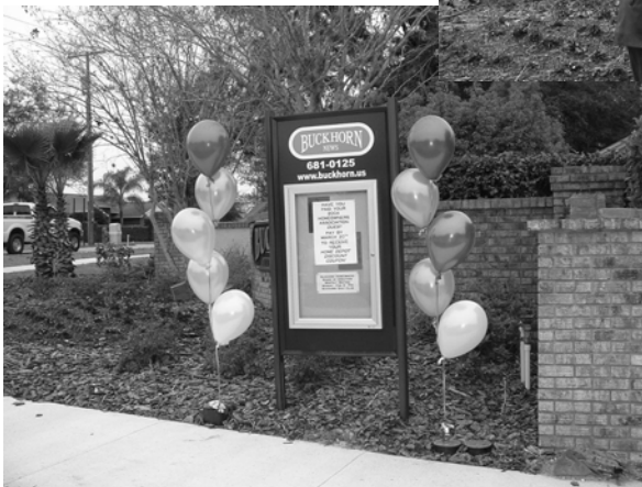
One of four informational signs at each of the Buckhorn Estates entrances