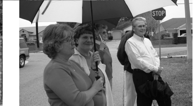
Buckhorn Estates residents at the dedication despite some inclement weather.