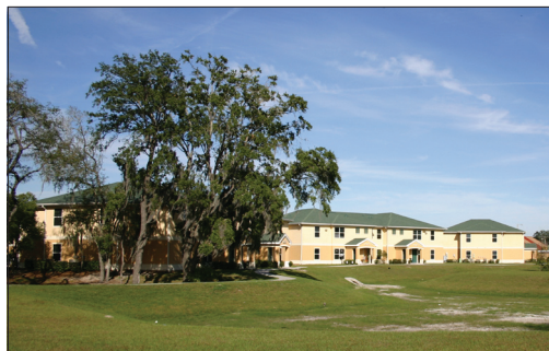
Robbins Manufacturing Company Brownfield Area After Redevelopment

In May 1999, the Board of County Commissioners adopted the Brownfields policy to provide assistance and incentives to public and private property owners and businesses to facilitate the owner's environmental cleanup and reuse of contaminated urban property as part of the County's redevelopment and growth management strategy.