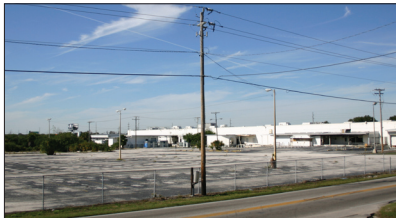
Waters Center Brownfield Area Before Redevelopment

Brownfields are real property, the expansion, redevelopment or reuse of which may be complicated by actual or perceived environmental contamination.