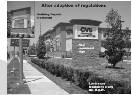
Images show how development is improved through the application of land development regulations in the Hillsborough Avenue Overlay District