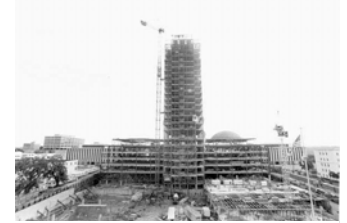
Florida's Current Capitol Under Construction in the 1970's