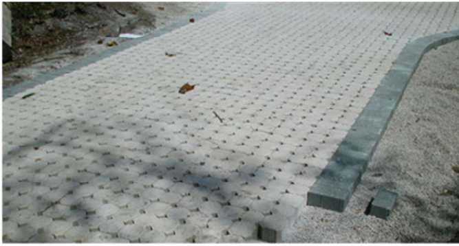
These interlocking concrete pavers were used on the driveway at the model home of the Madera subdivision in Gainesville.