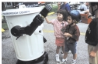
Raise your hand if you recycle.