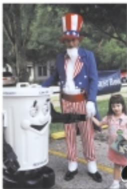
Uncle Sam says, "recycling is one way we can all do our part for America"!

Lutz Community Council Bike Rodeo at Lutz Elementary School