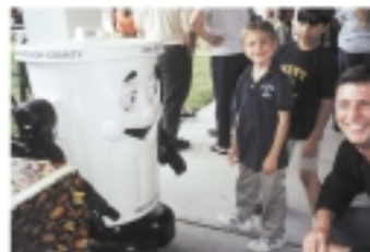
These students are learning to spread the word about recycling.

Westchase Elementary School Fall Festival