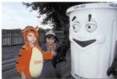
"Can Do" and Tiger too.

Annual Halloween Horribles Parade at Center Place in Brandon