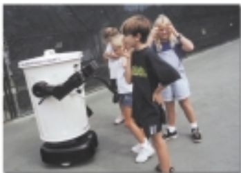
This young man ponders a future of recycling.