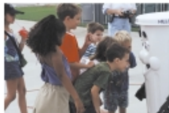
When "Can Do" talks everybody listens.

Villa Rosa Homeowners Association Community Tailgate Party at Villa Rosa Community Park