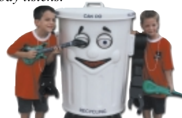
"Can Do" says, "recycling is music to my ears."