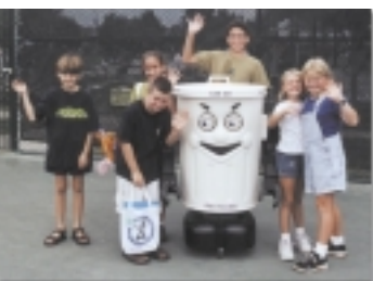
This generation waved goodbye to the days before recycling.

Countryway Homeowners Association Community Picnic at Countryway Tennis Court & Pavilion