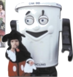
There is no mousing around when it comes to recycling.