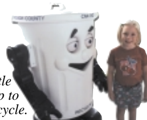
Thank heaven for little girls who grow up to recycle.

If your community is planning an event and would like to have "CAN DO" attend, please call the Hillsborough County Solid Waste Management Department at 272-5680 for further information.