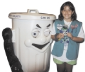
A souvenir will help this young lady remember what recycling is all about.

Kid's Fest/Health & Safety Fair at the Tampa Convention Center