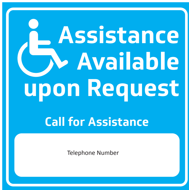
4" X 4" sign (actual size)

Failure to comply with these regulations could result in a violation notice, adjudication, and civil penalties. Likewise, a violation of this article may also be criminally prosecuted in the same manner as a misdemeanor in accordance with the provisions of F.S. § 125.69, and is punishable by a fine not to exceed $500 or by imprisonment for a period not to exceed 60 days or by both such fine and imprisonment. The Hillsborough County ADA Coordinator, Code Enforcement Regulatory Compliance investigators, and law enforcement are authorized to enforce the cited provisions.