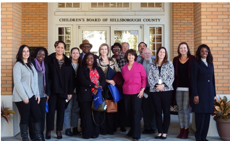
Backstage Pass – Back Again! kicked off with a session at the Children's Board of Hillsborough County.