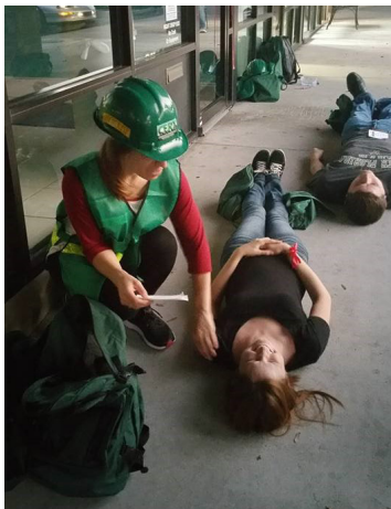
Members of the University of South Florida Community Emergency Response Team (CERT) partner with ONR to provide neighborhood disaster preparedness training.