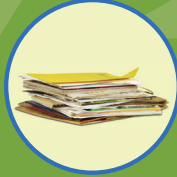
Dry Paper, Newspaper, and Junk Mail