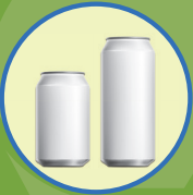
Clean Aluminum Cans