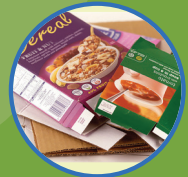
Dry Paperboard Boxes